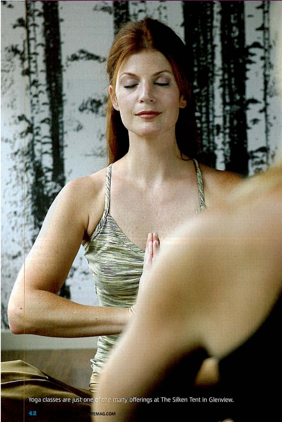
Yoga classes are just one of the many offerings at The Silken Tent in Glenview.

From the ancient mineral baths of the Dead Sea to the legendary Golden Door spa of California, great spas of the world have been coveted vacation destinations for centuries. But with so many luxurious day spas located right here in the northern suburbs, there's no reason you can't pamper yourself and still remain close to home. From haute mud wraps to hot-stone massages, chakra realignments to miracle treatments that have you aging in reverse, here are just 10 of our favorite North Shore "spa-cation" destinations for 2009.